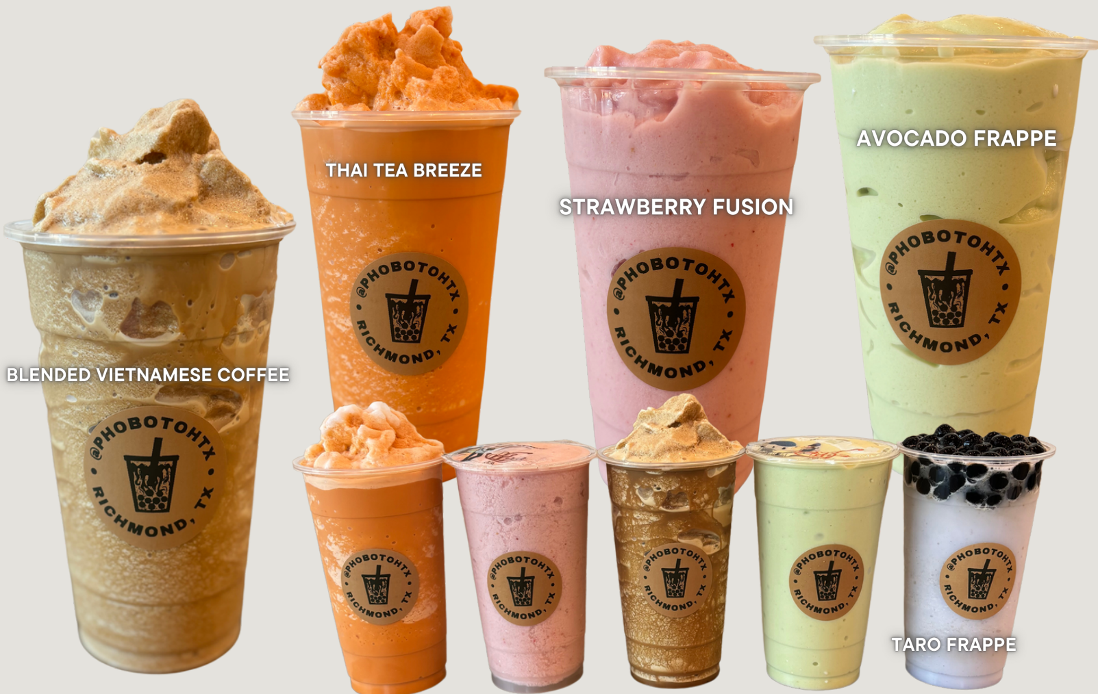
BLENDED VIETNAMESE COFFEE

Banana Split, Cookies & Cream, Cotton Candy, Birthday Cake, Chocolate, Rainbow Ice (No Dairy), Cookie Dough